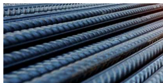
High Quality Reinforced Steel