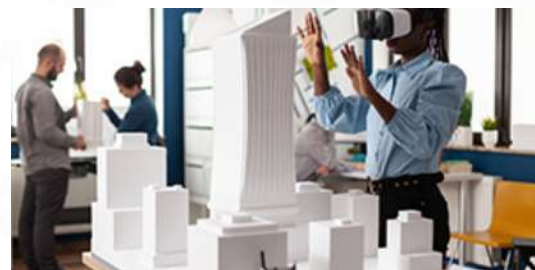
Adv. Construction Technology