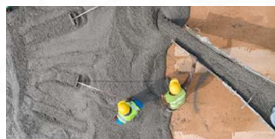
High Grade Concrete