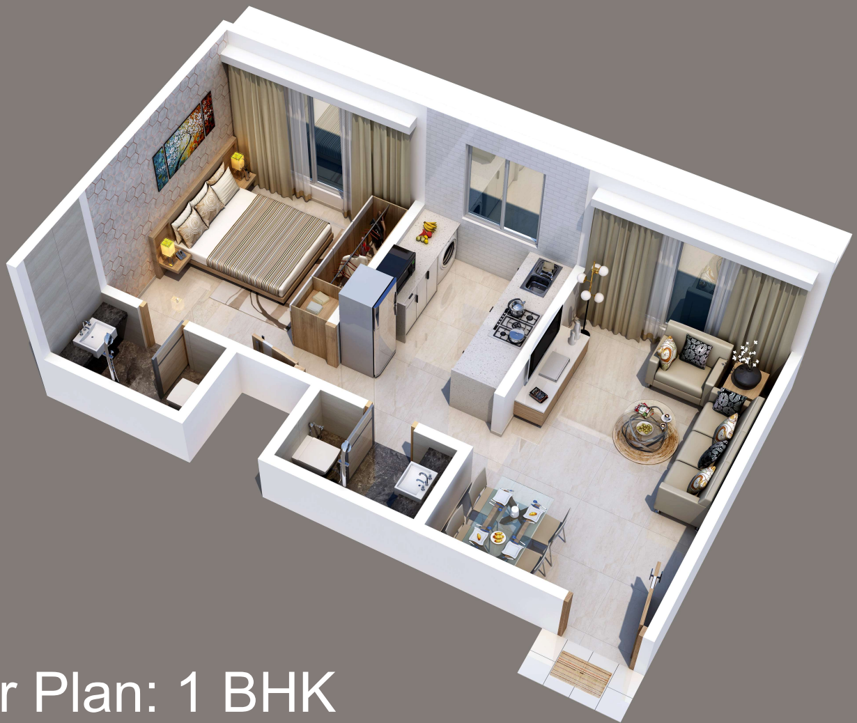
Floor Plan: 1 BHK