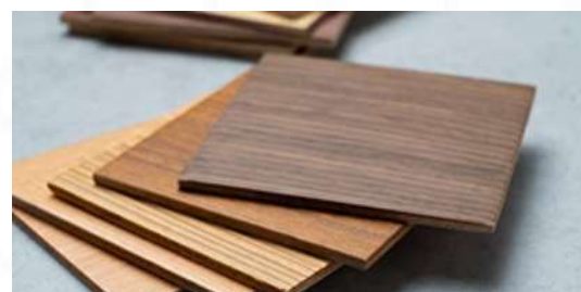
Veneer Doors System Windows