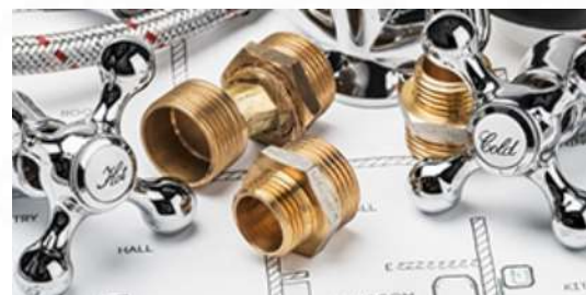
Best in Class Fixtures & Fittings