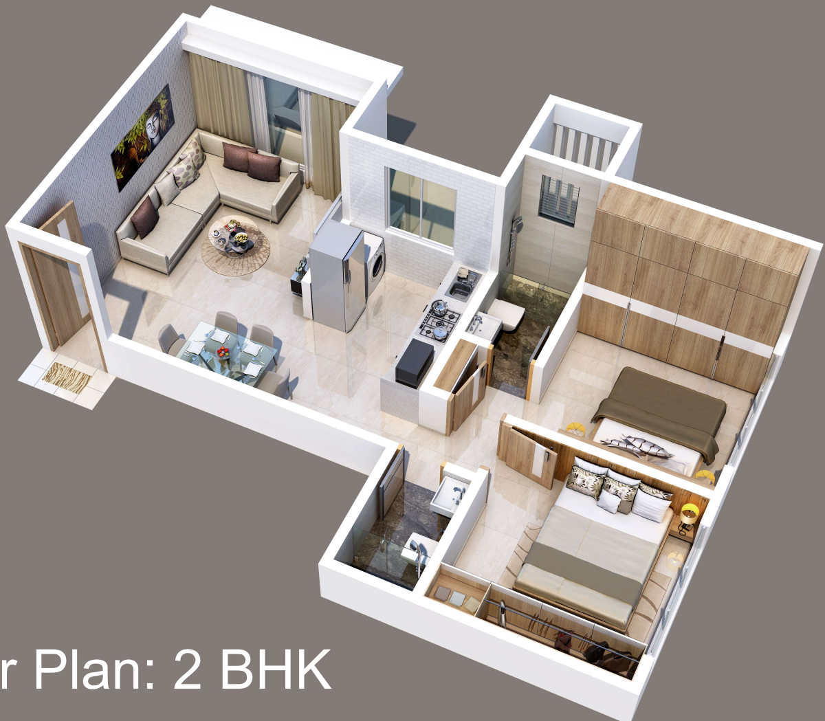
Floor Plan: 2 BHK